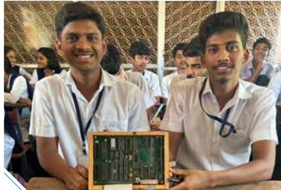
Engineering Kit for students.