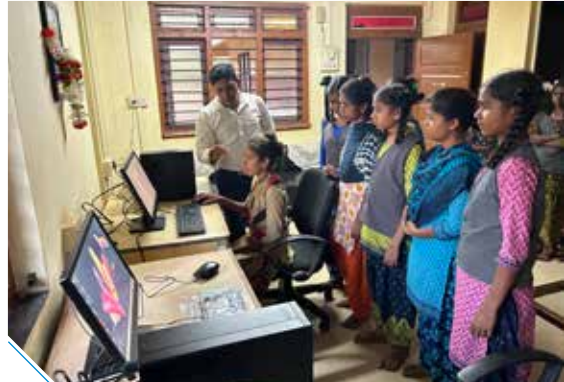
Providing an educational facilities to underprivileged girls students.